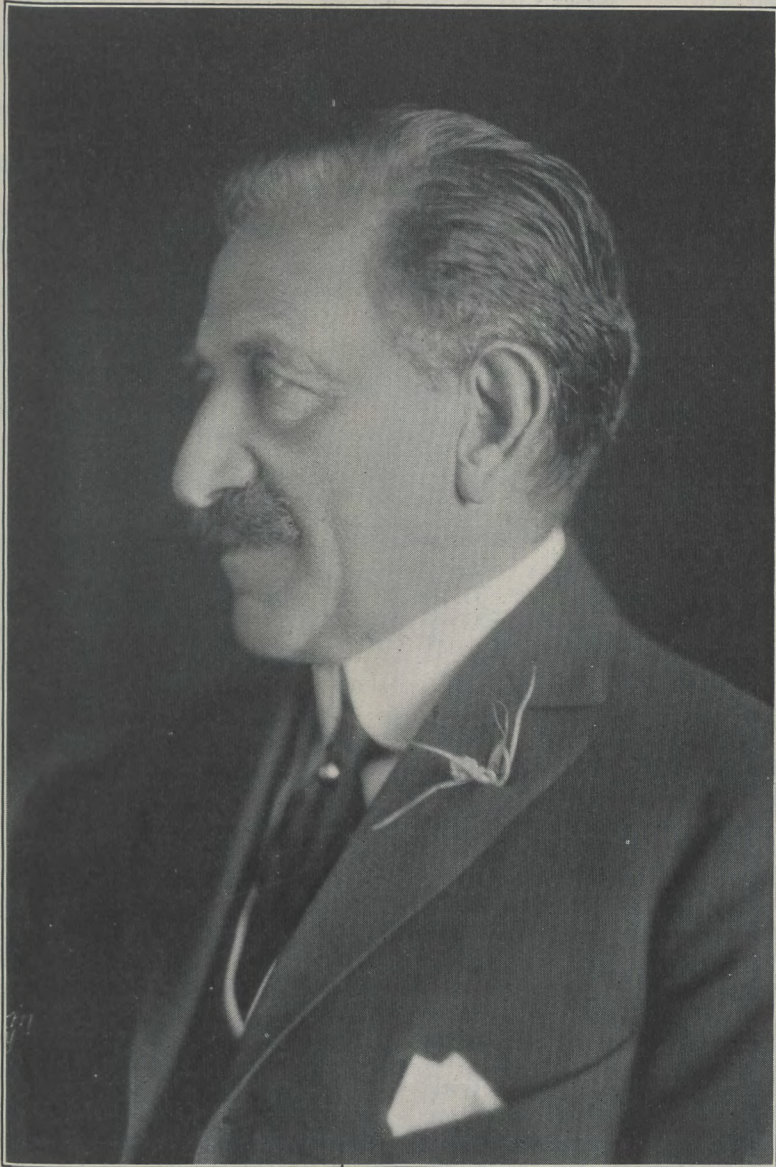
HON. SAMUEL UNTERMYER