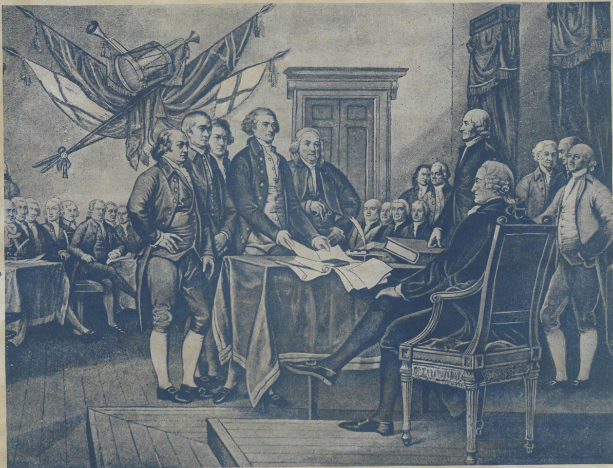
SIGNERS OF THE DECLARATION OF INDEPENDENCE AT PHILADELPHIA, JULY 4, 1776.

1776—1936 One Hundred and Sixty Years of Progress