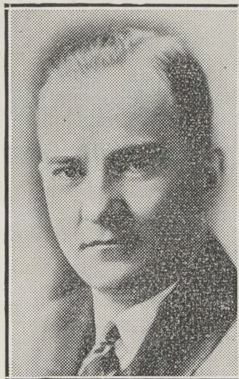
HARRY W. COLMERY

people and not the people of government. These are priceless heritages and we must never forget that they belong not alone to us but to our children and posterity for generations to come. We are but the custodians of American freedom for the moment, and it is our sacred duty to pass it on untarnished to those who shortly will take our places. How best may this be done? By succumbing to momentary passions and throttling freedom of speech, freedom of religion, freedom of the press and freedom to peaceably assemble? I think not, and in that statement I am confident The American