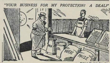
A British view of Hitler's interest in Romania.

Let us not follow in their tragic footsteps. You, soldiers of America, who have given proof of your loyalty to America in war and in peace, help keep America free, clean, just, tolerant and united!