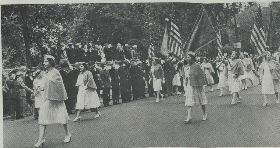
THE LADIES AUXILIARY MARCHES BY