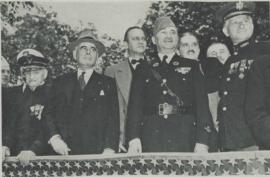
THE REVIEWING STAND