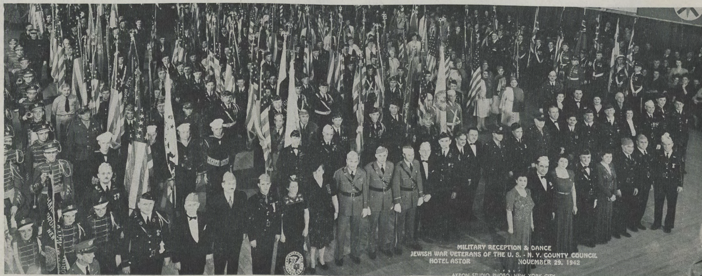
PRESENTATION OF COLORS, NEW YORK COUNTY MILITARY BALL.