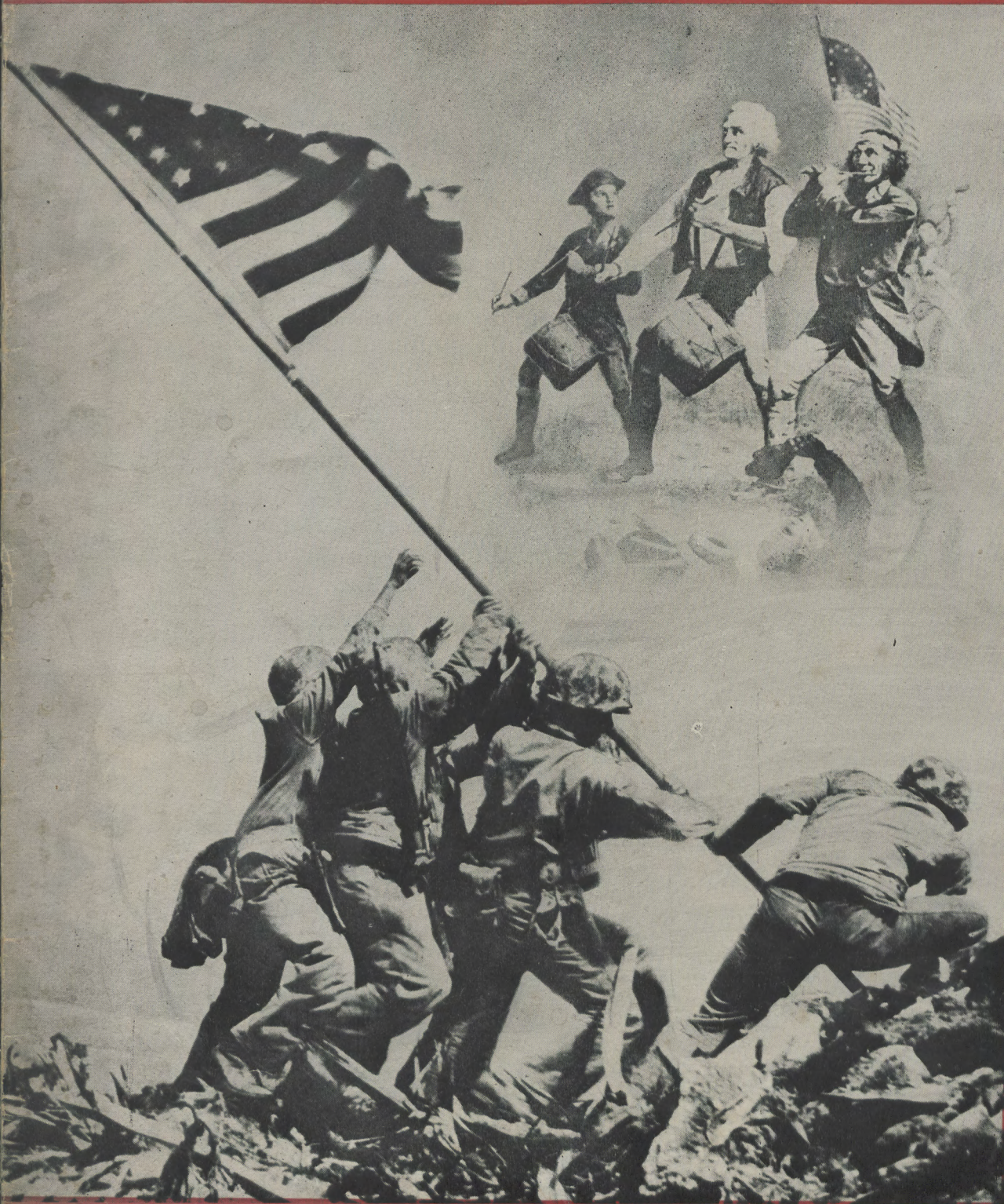
OLD GLORY AT IWO JIMA