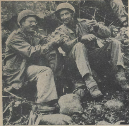
Joe Rosenthal (left) with Marine sergeant