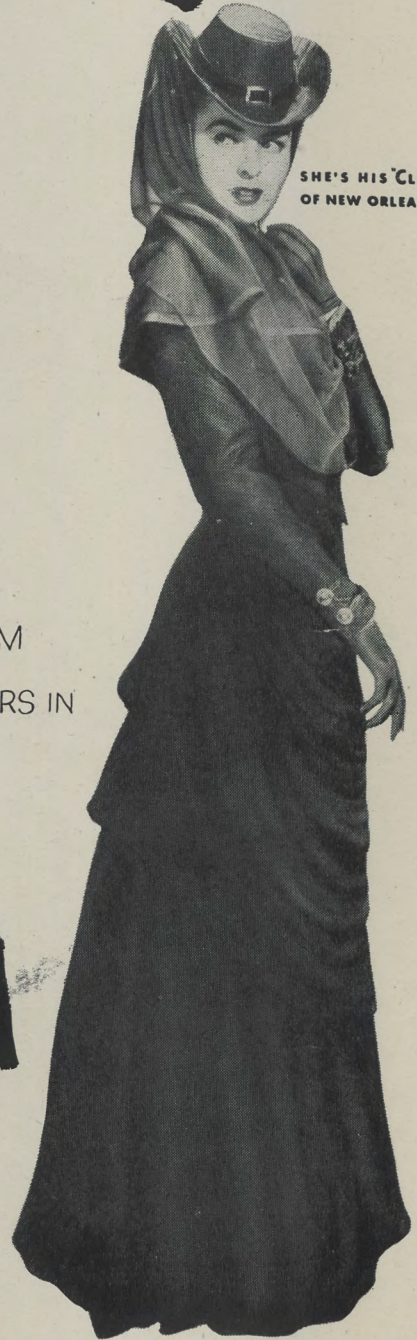
SHE'S HIS "CLIO" OF NEW ORLEANS

YOU CAN'T DREAM OF A TEAM MORE EXCITING THAN THE LOVERS IN