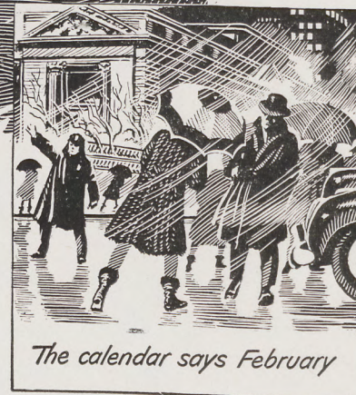
The calendar says February

Sun-warmed beaches are waiting for you only a few hours away from any major airport in the U. S. . . . Get your ticket today!