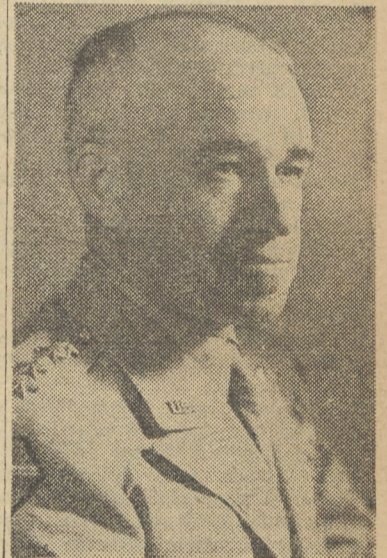
GEN. OMAR N. BRADLEY