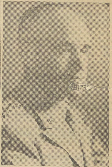
GEN. OMAR N. BRADLEY

On this thorny issue the NEC decided that picketing cannot be (Continued on Page 3)