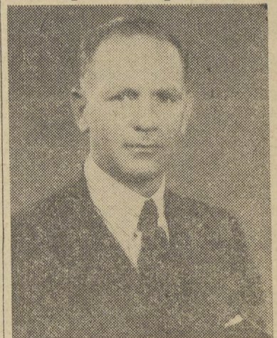
GORDON GRAY, Army Secretary