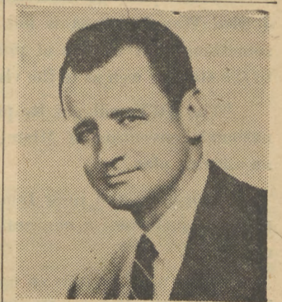
Sen. George A. Smathers Democrat of Florida

Senator Smathers will be the guest speaker at the Florida Day Luncheon on Thursday, October 28th. He was the first World War II Veteran to gain a seat in the House of Representatives.