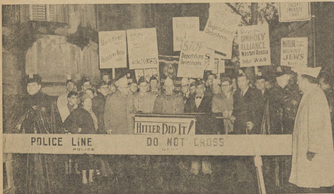
HOLDING THE LINE: Holding their banners high, a delegation of Jewish War Veteran comrades are shown as they began picketing in front of the Egyptian Consulate in New York City. The members paraded before the Consulate for hours in the rain in a visible protest against Egyptian cruelty and deception. The group was commended by Commander Carmen who had given them permission to carry on the picketing earlier.