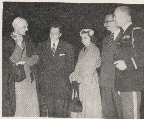
With the Dean of Westminster Abbey and the head of AJEX.

You would see beasts of burden working side by side with gigantic trucks; men preparing the soil with their hand-made hoes and others using the most powerful diesel tractors. It is a country where everything available is put to use, but because pioneering, immigration and industrialization are all taking place simultaneously, the progress is not as fast as in older countries. However, the nation of Israel is rapidly approaching the modernization of tomorrow and through new industrial developments, it will one day reach its objective and become one of the most pro-