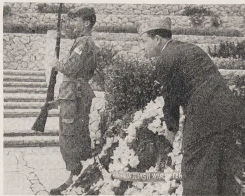
Laying a wreath at the tomb of the Unknown soldier in Israel.