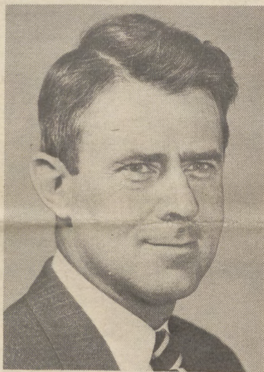
Cyrus R. Vance Deputy Secretary of Defense

Reservations for JWV's 70th Annual National Convention have been received by the JWV reservation office at the Concord Hotel in Kiamesha Lake, New York, at an unprecedented rate, indicating a record attendance for the best JWV convention ever, scheduled to open on September 12th.