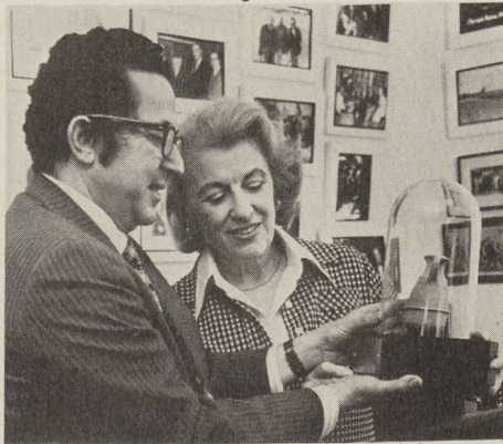
BEL KAUFMAN (right)