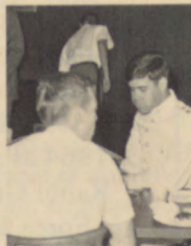
WEST POINT- where the JWV is active . . . p. 6

The Jewish War Veteran is published seven times a year: January-February, March-April, May-June, July-August, September-October, November, December by the Jewish War Veterans of the United States of America at Washington, D.C. Second-class postage paid at Washington, D.C. Subscription price in the United States is $2.00 per year, payable in advance. Advertising information and rates available from the Advertising Director or any of the advertising representatives. JWV National Headquarters, 1712 New Hampshire Avenue, N.W., Washington, D.C. 20009.