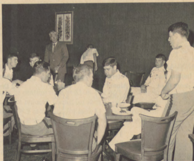
Jewish service and social

facilities conducted by the Jewish Cadets and then J.W.V. hosted a picnic for the officers and their families, as well as the Cadets. In addition to this visit, various J.W.V. units have already sponsored seven Oneg Shabbats with at least six more scheduled at this time.