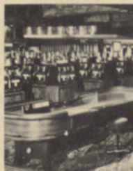
LAS VEGAS- where the action is . . . p. 12