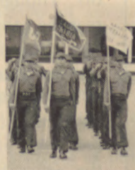
SAUDI ARABIA- whose National Guardsmen will be trained by U.S. Vets . . . p. 24