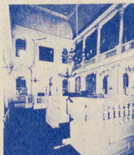
JEWISH HISTORY— A Bicentennial Report on Jews in America ... p. 12