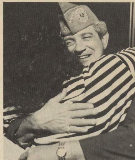
The New National Commander receives a congratulatory hug.

On a national level, there are many challenges facing the veteran community, regardless of which political party prevails in November. We must retain our commitment to seeking maintenance of benefits through the VA for our aging veterans. We must pursue programs for