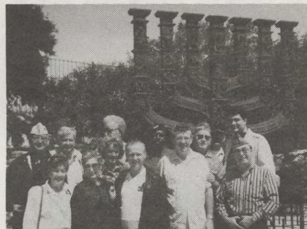
Participants of JWV's First Allied Veterans' Mission to Israel.

chusetts says he returned from the mission with "a greater understanding of Israel's people and their problems." He feels Israelis are "threatened and need to be strong militarily to defend themselves."