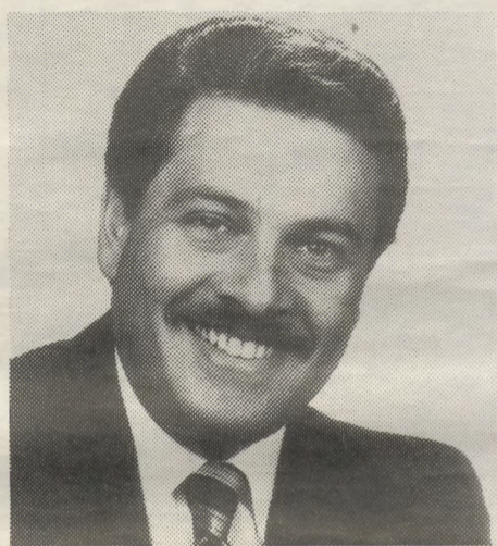
Representative Lawrence J. Smith