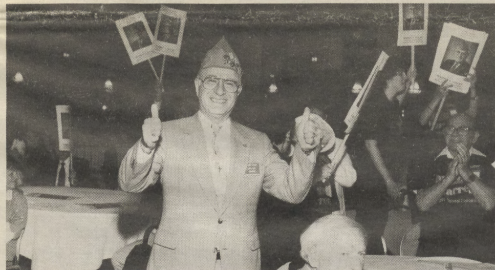
National Commander Warren S. Dolny is jubilant at Final Convention Session of JWV's 97th Annual National Convention.