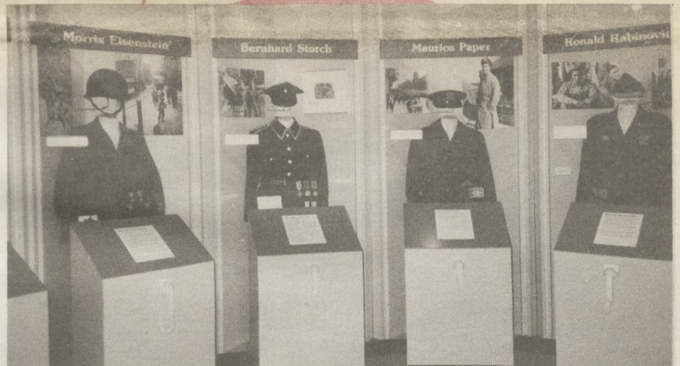
A portion of the new museum exhibit, "GI's Remember; Liberating the Concentration Camps".