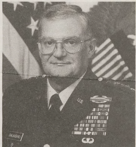
General John M. Shalikashvili.

General Shalikashvili was emphatic when he declared that the men and women serving today in America's armed forces are ready to protect America's interests, whether it be a