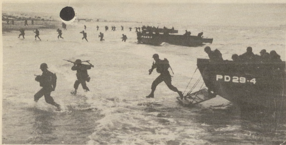
Allied soldiers storm Normandy Beach during D-Day.