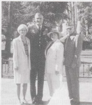
Chairman of the Joint Chiefs of Staff General Shelton JWV receives General Henry Shelton, among other leaders at 1999 National Convention COVERAGE ON PAGE 14