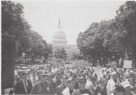
Veterans Gather in Washington JWV leads the way in a rally on the steps of the Senate building. COVERAGE ON PAGES 6-7