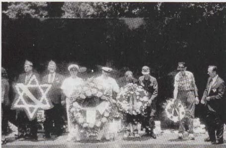
Memorial Day Ceremonies The nation's capital pauses to remember those who served proudly. SEE PAGE 22