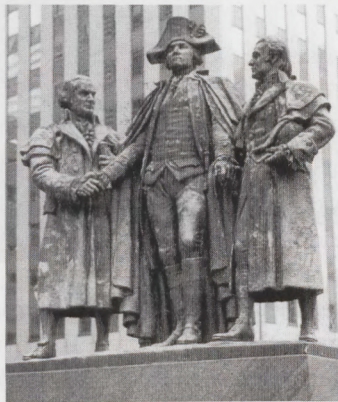
THE ROLE OF AMERICAN JEWS PAGE 8