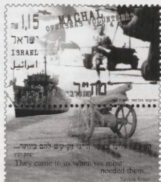
ISRAEL DEFENSE FORCE PAGE 24