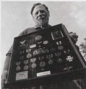
HONOR MATTERS PAGE 9