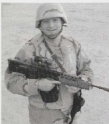
CHANUKAH IN THE SANDBOX PAGE 22