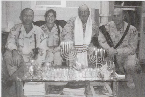
HANUKKAH IN KABUL PAGE 12