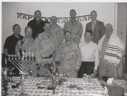
Chanukah in Iraq