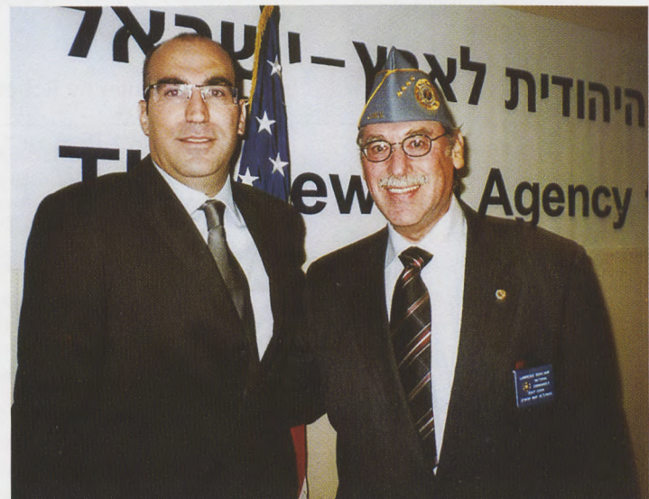
National Commander Lawrence Schulman with Israel's UN Council General Ambassador Asaf Shariv