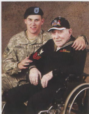
Across the Generations Page 14