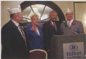
Host a Legislative Breakfast Page 8