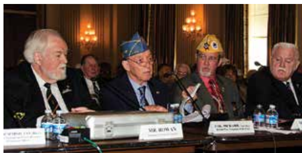
National Commander Dr. Robert Pickard testifying before the Committee.

The backlog of cases at the VA remains at over 270 days. JWV calls upon Congress to authorize the hiring and training of additional claims adjudicators and the introduction of improved electronic systems to reduce the backlog and allow for adjudication of claims to be made in a reasonable period. If adjudication cannot be made within 180 days, the applicant's disabilities should be presumptively determined to be service-connected and the applicant eligible for