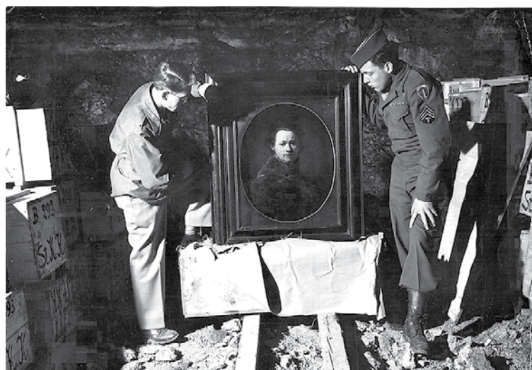
Harry Ettlinger (right) with a Rembrandt painting salvaged from a salt mine in 1945. Monuments Man Ettlinger is the Department Commander of NJ.

Later, the unit of 345 members from 13 countries — many were art historians, archivists and architects — rescued more than 5 million