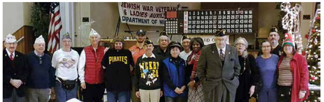
The Department of Michigan and its Ladies Auxiliary took part in their 68th consecutive Christmas day visit to the Battle Creek VA Medical Center. JWV volunteers visited with over 200 patients, played bingo, and provided clothing, healthy snacks, and other items.