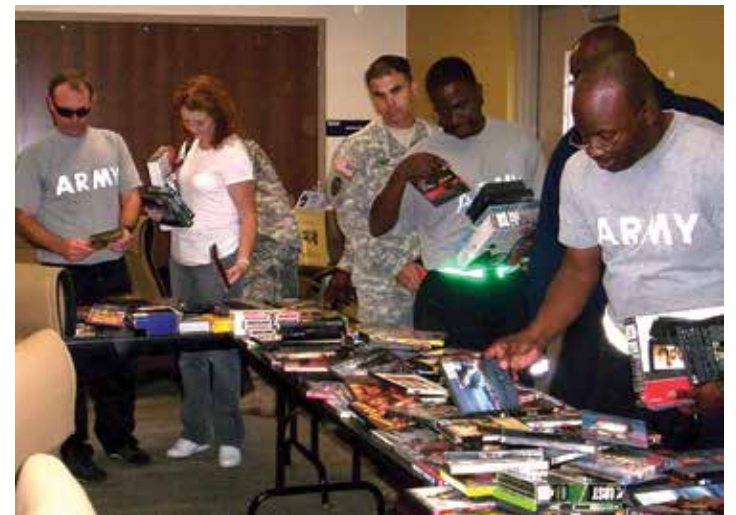
On October 1, 2013, members of Post 39 NJ, for the second year in a row, traveled to Ft. Belvoir, VA to distribute 75 DVD players that the Post purchased and hundreds of DVDs contributed by the community to returning wounded veterans. Direct financial aid was also provided by the Post to the Wounded Warrior Project, Operation Homefront, Operation First Response, and the Fisher House. Pictured: veterans and servicemembers at Ft. Belvoir holding their DVD players and selecting DVDs.