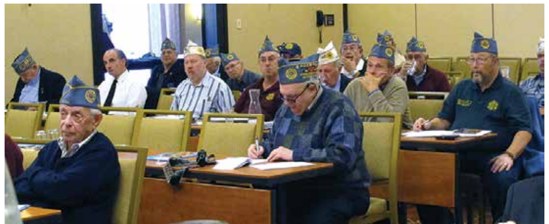
JWV Delegates listen during the National Executive Committee Meeting.