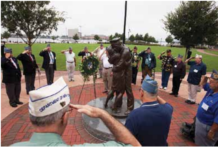
JWV members salute during a wreath-laying ceremony at The Homecoming statue in Norfolk's Town Point Park on August 8, 2012.