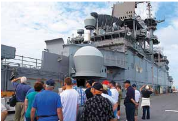
JWV members tour the USS Wasp (LHD 1), a multipurpose amphibious assault ship.