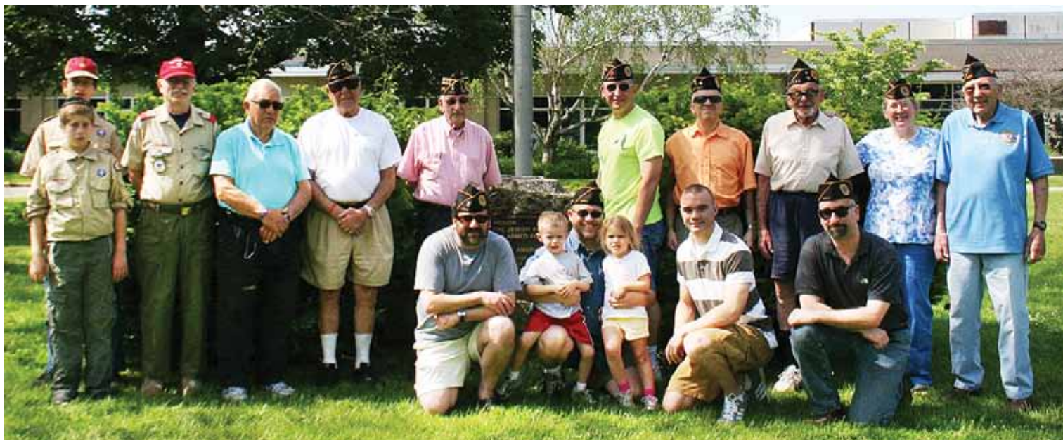
Post members, guests, friends, and scouts of Boy Scout Troop 33 join for a group photo following the Post 105 NY Memorial Day ceremony held at the JCC on Sunday, May 20. The Post remembered fellow comrades who passed away this year and all of the fallen Jewish personnel killed in Iraq and Afghanistan.