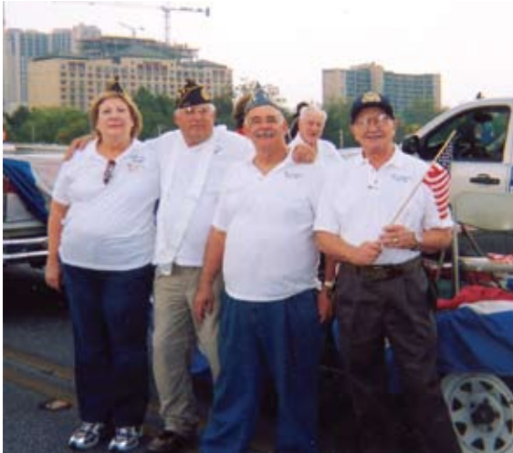
Members of JWV Austin, TX, Post 757 participated in the annual Veterans Day parade in downtown Austin. The Post had a float in support of veterans and marched along with it. Members of the Post also participated in a wreath-laying ceremony at the Texas Veterans Memorial.